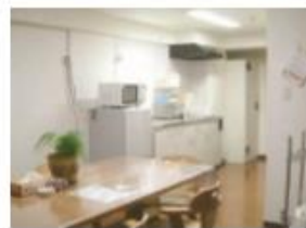
Apartment Kitchen area