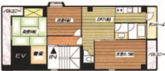
Apartment layout for the 3 room apartment